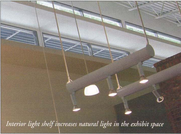
Interior light shelf increases natural light in the exhibit space